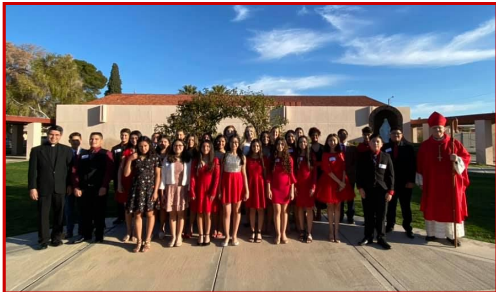
8th Grade Confirmation Class of 2020

We continue to pray for our Confirmandi that the gifts of the Holy Spirit will continue and always guide their lives.