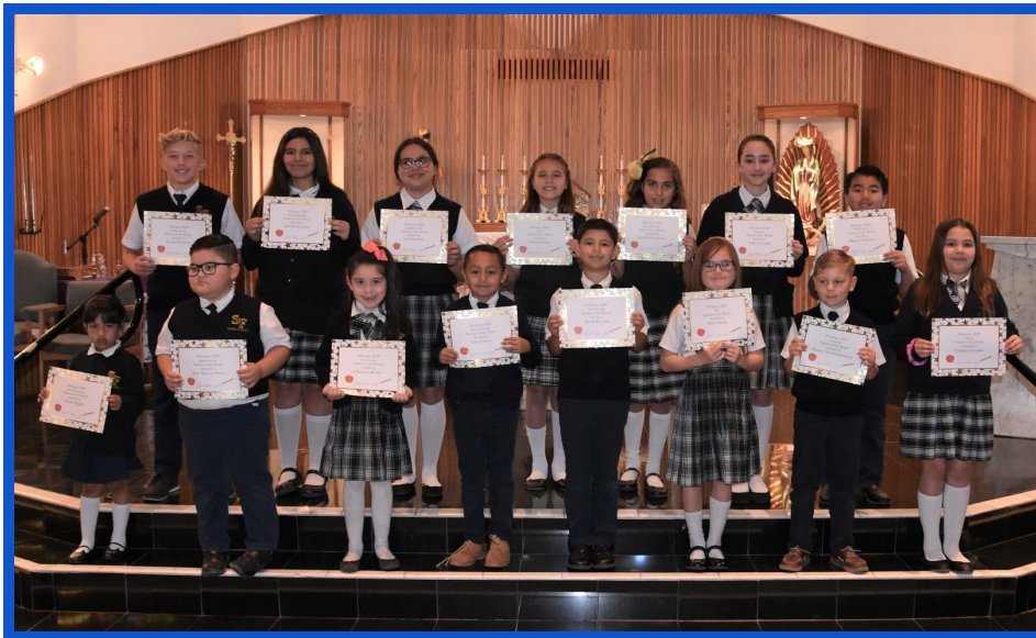
February Students of the Month!