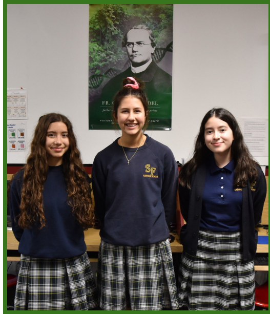
Our Yuma County Science Fair Winners!